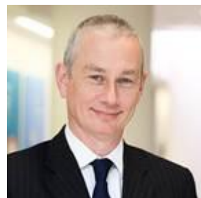
Cloud leader for IBM UK and Ireland